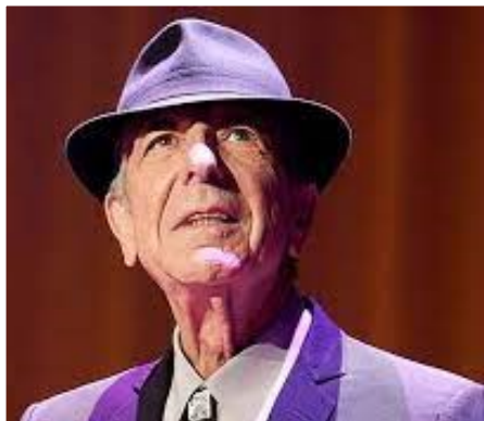
Leonard Cohen z'l

There is no admission fee and no tickets required, feel free to invite friends and neighbors for this fascinating talk with musical examples.