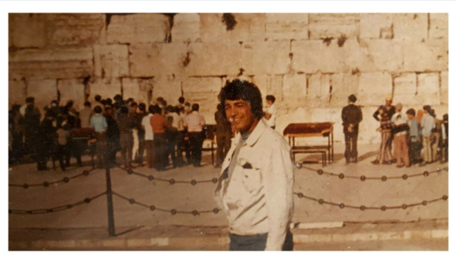
Hazzan at the Kotel, 1973.