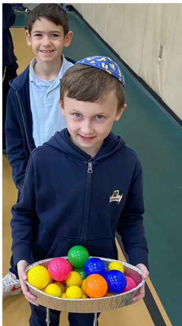
2B - 4B celebrated Lag Ba'Omer with some exciting relay races