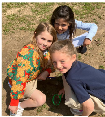
2G went on an insect hunt