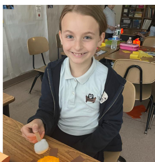
4G celebrated Lag Ba'Omer with a bonfire craft.