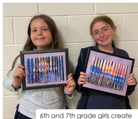
6th and 7th grade girls create Agam inspired artwork