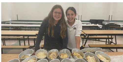
After completing a Chumash unit on the mitzvah of hafrashat challah, the sixth grade girls bake challah!