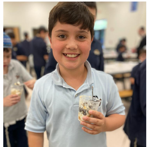
Indoor S'mores Making with 2B - 4B on Lag Ba'Omer