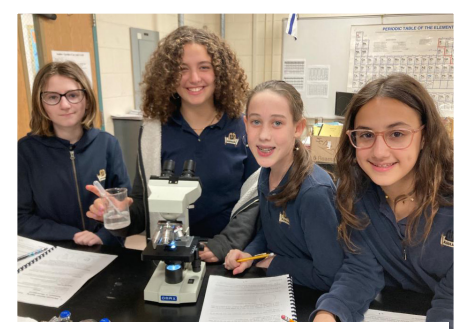
7th graders learn how to use a microscope