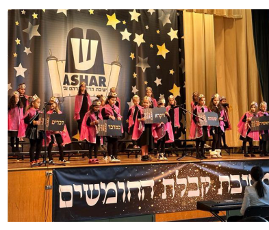
Mazel tov to our second grade girls who received their chumashim!