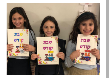
4G finishes a unit on hilchos Shabbos