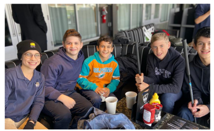
After thier hard work in the cemetery clean up project, 6th and 7th grade boys enjoyed a trip to Top Golf