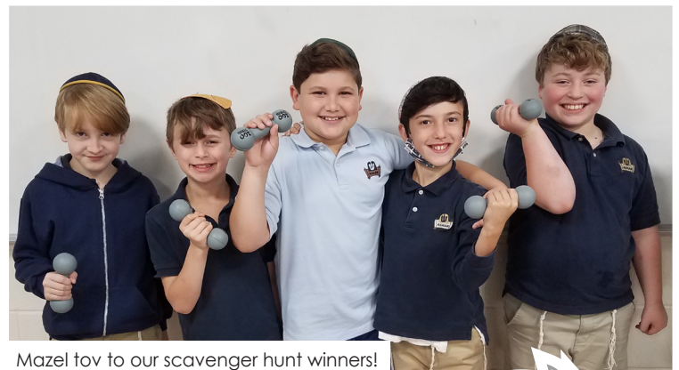
Mazel tov to our scavenger hunt winners!