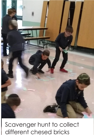
Scavenger hunt to collect different chesed bricks