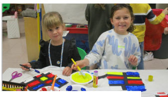
Painting like Piet Mondrian.