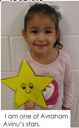
I am one of Avraham Avinu's stars.