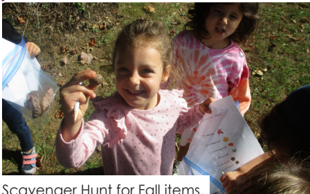
Scavenger Hunt for Fall items.