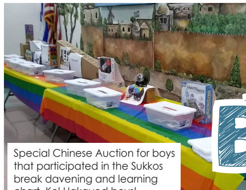
Special Chinese Auction for boys that participated in the Sukkos break davening and learning chart. Kol Hakavod boys!