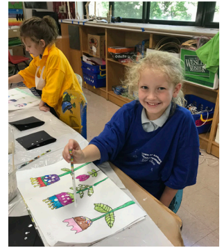
2G created flowers inspired by folk art.