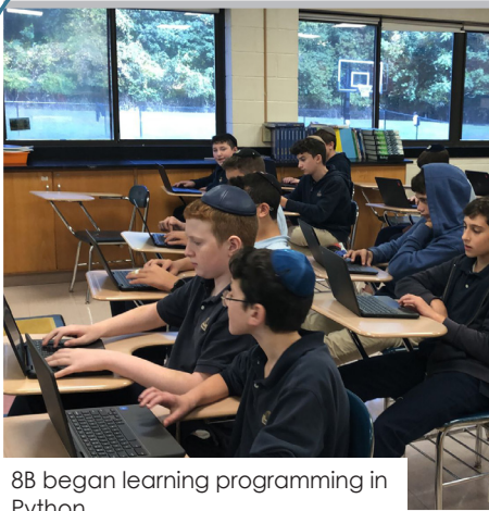
8B began learning programming in Python