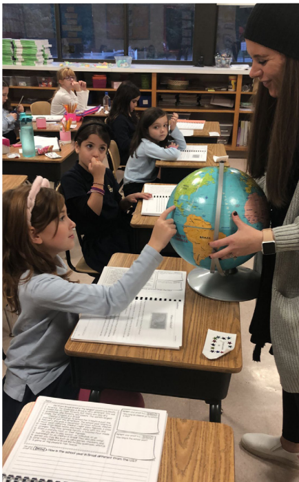
3G is learning about the country of Mexico this week in Social Studies.

Hashem was looking for an opportunity to help Avraham become a better person. Hashem knew that Avraham would pass the test. He still tested