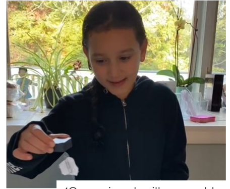
4G experiments with magnets!