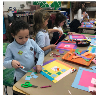
1G is working on quilt squares inspired by the Quilts of Gee's Bend, created by a group of African-American women in Gee's Bend, Alabama.