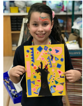
3G created modern trees.