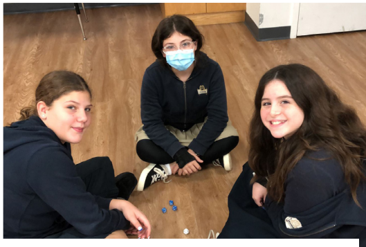
7G plays math game to review order of operations