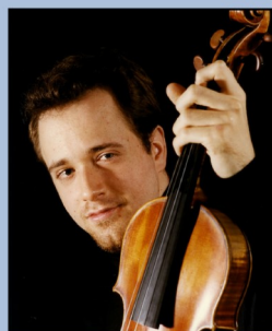
Violinist-Composer ITTAI SHAPIRA