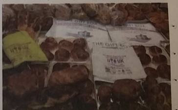
Some of the challahs delivered to the GIFT warehouse from the Great Challah Make.