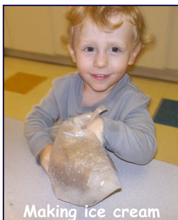
Making ice cream