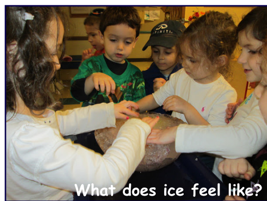
What does ice feel like?