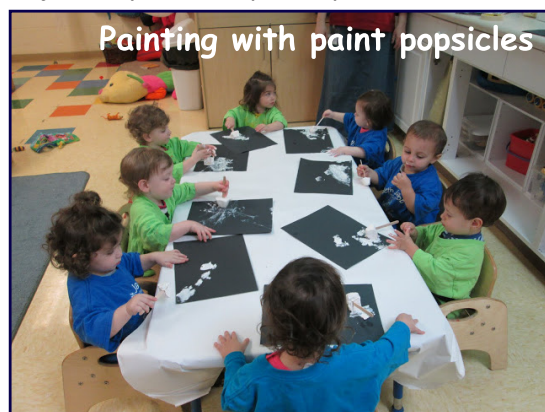
Painting with paint popsicles