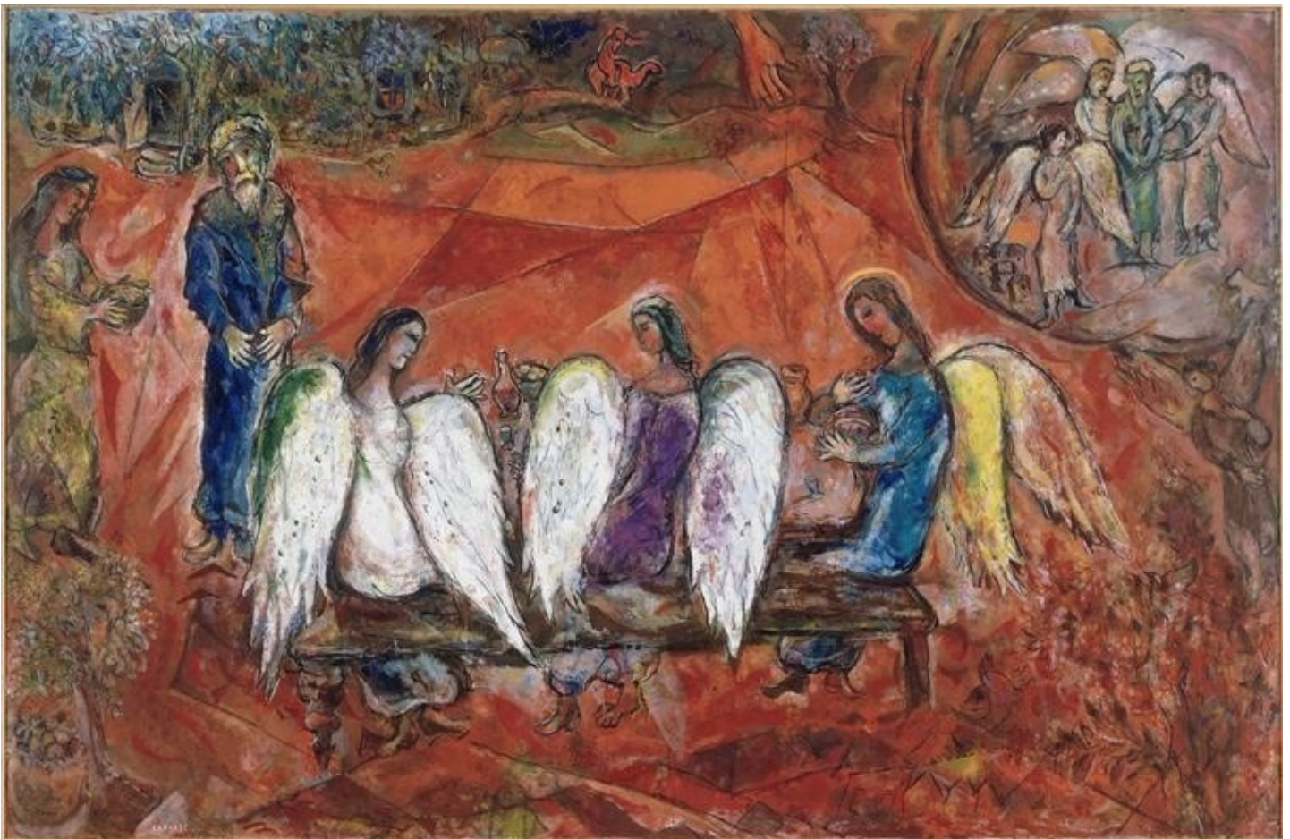
Abraham, Sarah and the three Angels, Marc Chagall 1966

22 The men turned away and went toward Sodom, but Abraham remained standing before Adonai. 23 Then Abraham approached him and said: “Will you sweep away the righteous with the wicked? 24 What if there are fifty righteous people in the city? Will you really sweep it away and not spare the place for the sake of the fifty righteous people in it? 25 Far be it from you to do such a thing—to kill the righteous with the wicked, treating the righteous and the wicked alike. Far be it from you! Will not the Judge of all the earth do right?”