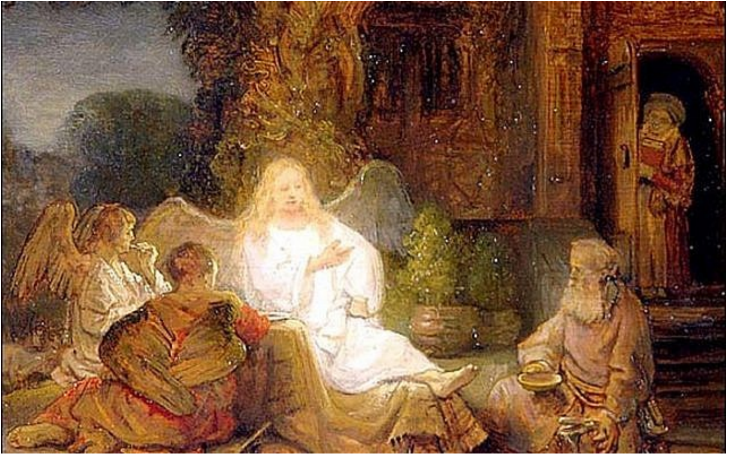
Rembrandt, Abraham Serving the Three Angels , 1646