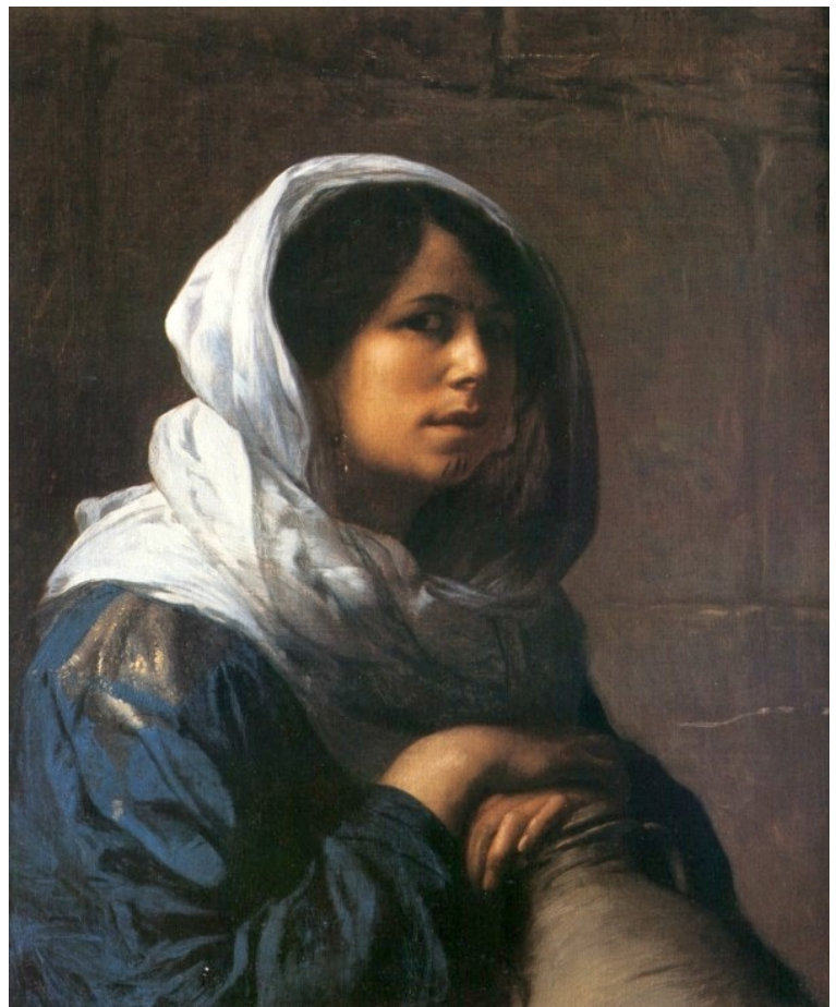
Jean Leon Jerome, Egyptian Water Carrier , 1882

20 And as for Ishmael, I have heard you: I will surely bless him; I will make him fruitful and will greatly increase his numbers. He will be the father of twelve rulers, and I will make him into a great nation. 21 But my covenant I will establish with Isaac, whom Sarah will bear to you by this time next year.” 22 When he had finished speaking with Abraham, God went up from him.