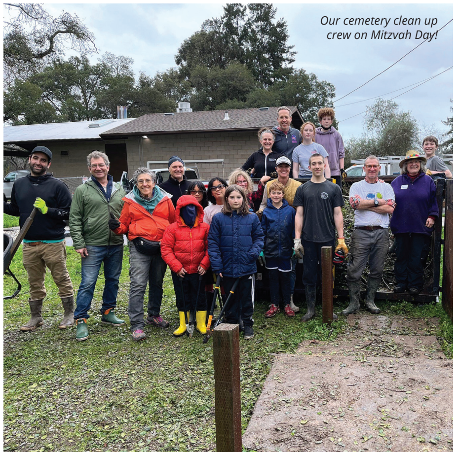
Our cemetery clean up crew on Mitzvah Day!