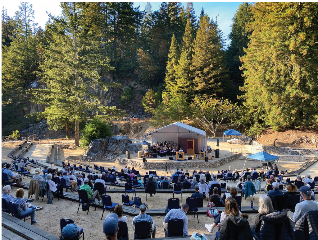
Rosh Hashanah Services at UCSC Quarry Ampitheater