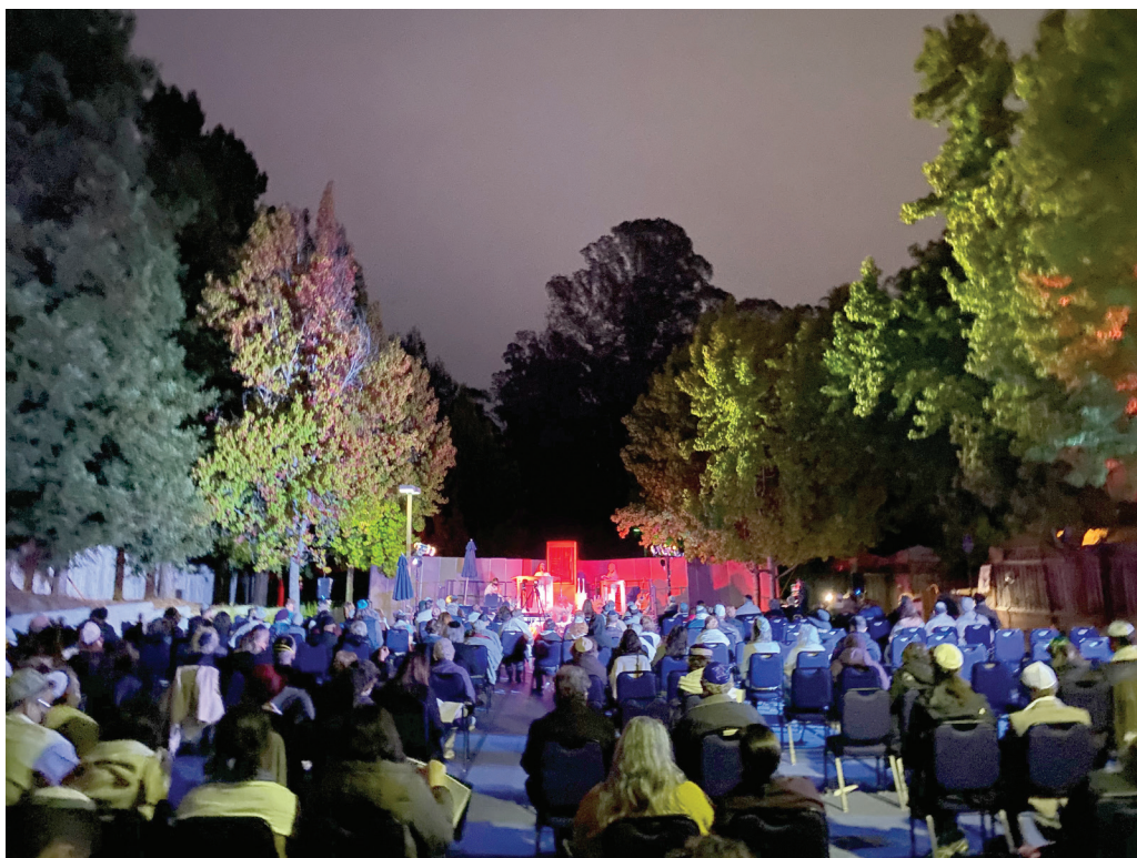
Yom Kippur Services at Temple Beth El