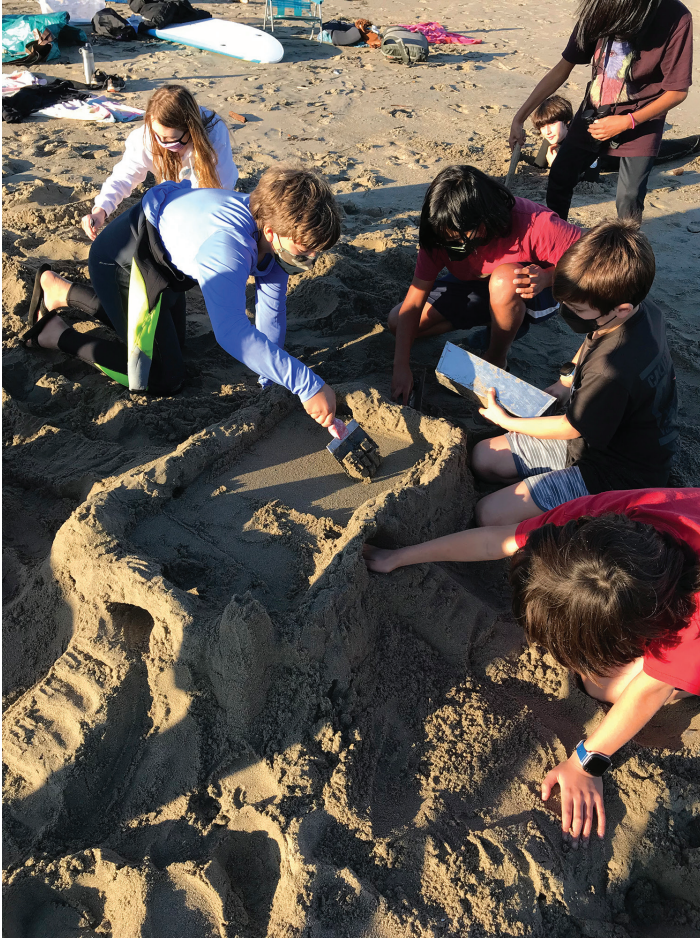
Building the Second Temple out of sand