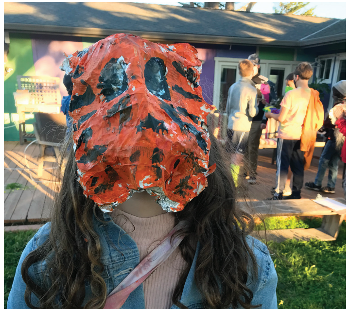
Making paper mache masks