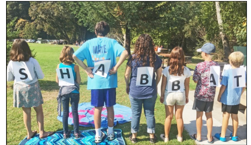
One of the games at the Community Picnic involved spelling Jewish holidays with letters on the backs of the children.