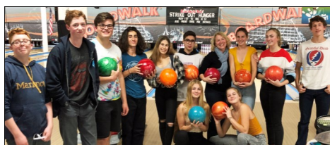
Recent SRFY Bowling Outing