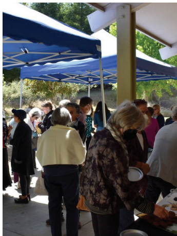
Snapshots from Snapshots in Song