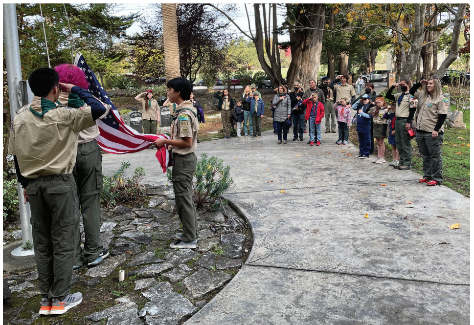
Scouts at Home of Peace | Scouts BSA Troop 614 performing a flag ceremony in recognition of veterans buried at Home of Peace on Veteran's Day