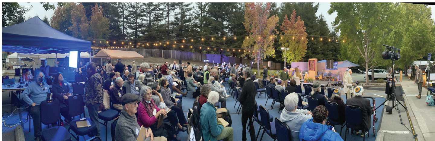
Once again we created a beautiful sacred outdoor space for prayer on Rosh Hashanah and Yom Kippur