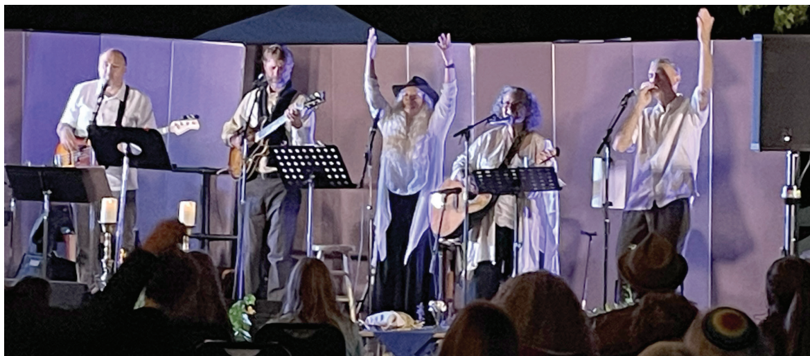
Our Rock Shabbat Band getting into the spirit of the High Holidays