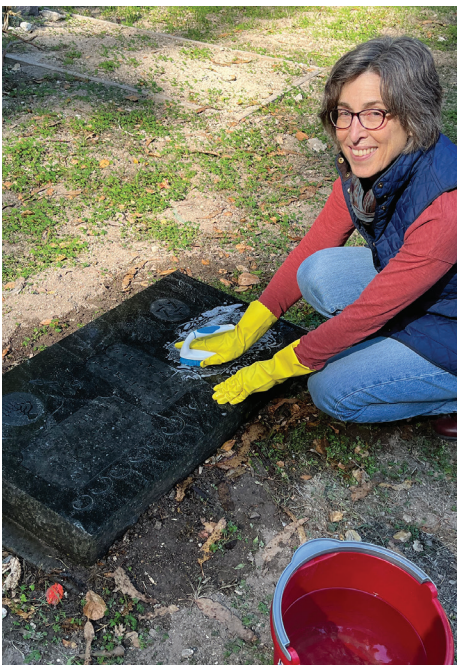
HOP service day | Headstone cleaning in preparation for Veteran's Day

The TBE Cemetery Committee is looking for a volunteer to lead and manage the effort to add a new divider wall, do some landscaping and otherwise beautify the Beit Olam area at our Soquel Cemetery , and to help manage Soquel Cemetery maintenance in general. Regarding the wall/landscaping project, we have some basic ideas and some money, but we need someone to select and hire a landscape architect, work up proposals, get construction estimates, etc. Simple project management, construction and/or landscaping/gardening experience preferred. If you are interested, please contact: Miles J. Dolinger , TBE Board of Directors, V.P. of Operations, miles@dolingerlaw.com .