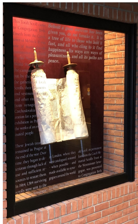
The display case was provided through generous contributions from the Ellen Herkowitz Judaica Art Fund and the Congregations 1992 Yom Kippur Appeal.

the Jewish community of Melnick and to all victims of the Holocaust. Most of all, it will be a living reminder of the imperishable truths it contains that have preserved the Jewish people for over five millennia.