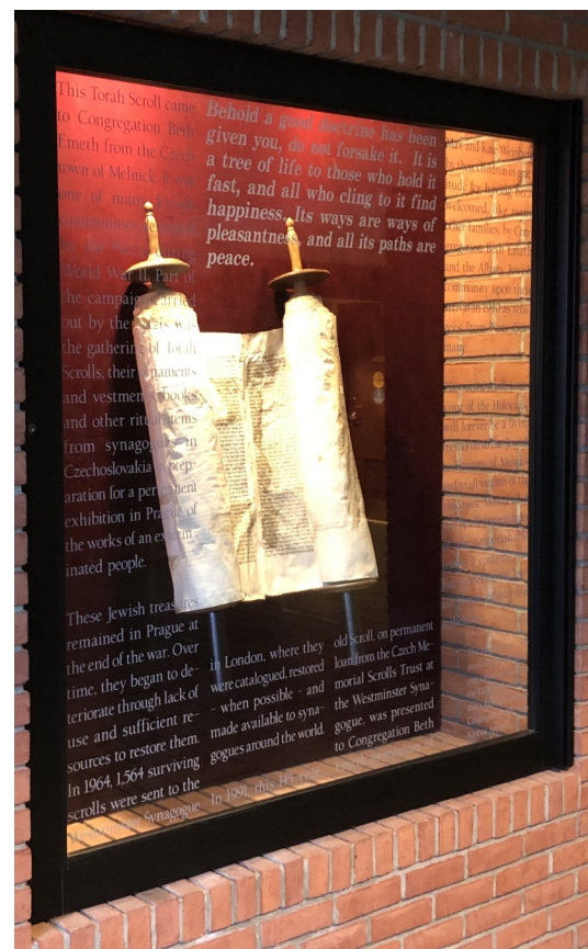
The display case was provided through generous contributions from the Ellen Herkowitz Judaica Art Fund and the Congregations 1992 Yom Kippur Appeal.

the Jewish community of Melnick and to all victims of the Holocaust. Most of all, it will be a living reminder of the imperishable truths it contains that have preserved the Jewish people for over five millennia.