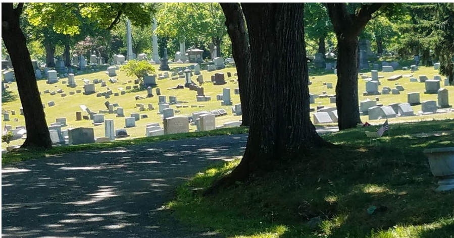
Congregation Beth Emeth Cemetery 58 Turner Lane, Loudonville, NY

A Perpetual Memorial for your loved one can be established through the office so that Kaddish is automatically recited each year on the designated yahrzeit in perpetuity. A named plaque will be mounted in the Sanctuary or Chapel during the week the yahrzeit is observed. In addition to being listed in the Temple Bulletin, a notice will be sent each year to those family members requested, reminding them of the date that their loved one's name will be recited at Shabbat Services.