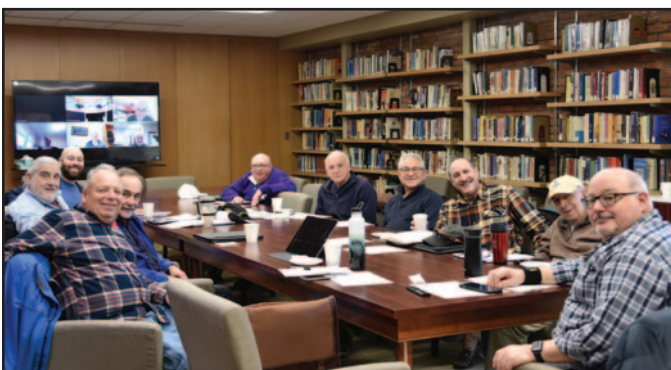
Brotherhood Meeting in the Larner Library September 2022