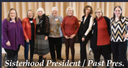
Sisterhood President / Past Pres.