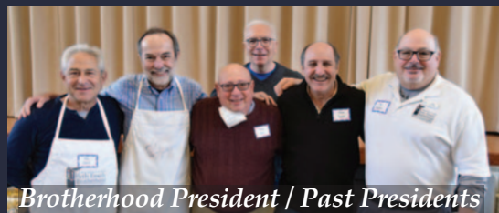
Brotherhood President / Past Presidents