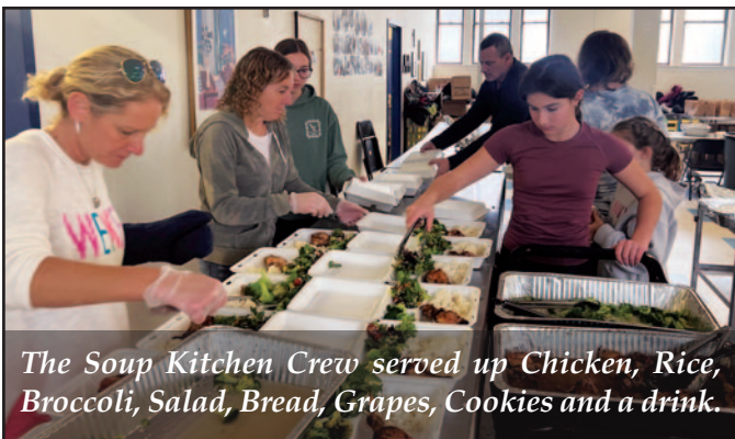
The Soup Kitchen Crew served up Chicken, Rice, Broccoli, Salad, Bread, Grapes, Cookies and a drink.

Concurrently, just a few miles away, volunteers from CBE came together to prepare and distribute lunch at the Soup Kitchen. The crew, made up of children and adults, worked as a team to ensure a healthy and delicious meal would be served. The servers distributed to-go meals with genuine sincerity and kindness, and were shown gratitude and appreciation. The atmosphere at the Soup Kitchen is inspiring.