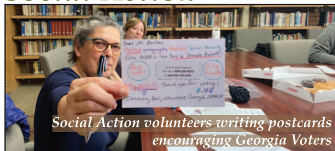
Social Action volunteers writing postcards encouraging Georgia Voters

Sisterhood is supporting the Congregation Beth Emeth Social Action Committee this year. We wrote postcards to residents of Georgia with the Every Voice, Every Vote campaign to encourage people to vote. And then again, to remind people to vote in the runoff election. Sisterhood members will be joining the other CBE affiliates by volunteering in the Soup Kitchen on Sunday, April 30.