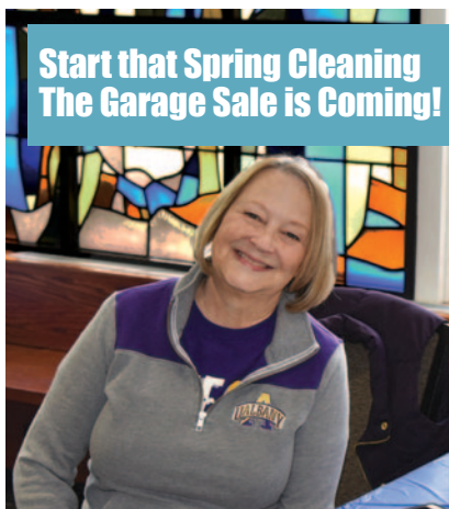
Start that Spring Cleaning The Garage Sale is Coming!