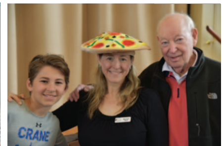
L'Dor V'Dor From Generation to Generation