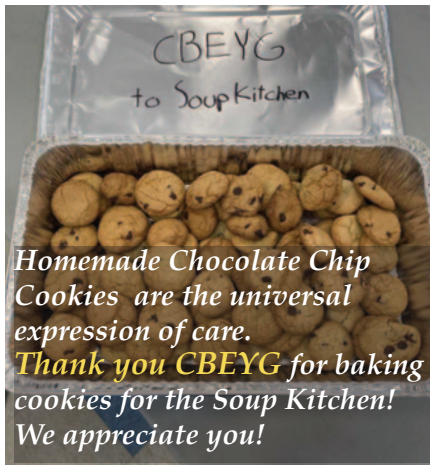
Homemade Chocolate Chip Cookies are the universal expression of care. Thank you CBEYG for baking cookies for the Soup Kitchen! We appreciate you!