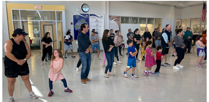
2 ND GRADE ISRAEL