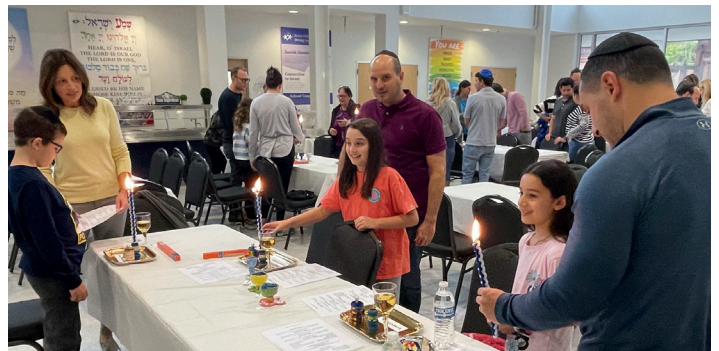
4 TH GRADE SHABBAT