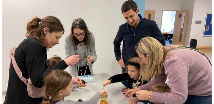
KINDERGARTEN TZAAR BAALEI CHAYIM (BE KIND TO ANIMALS)