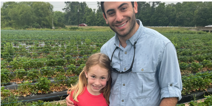
3 RD GRADE ADAMAH (EARTH)