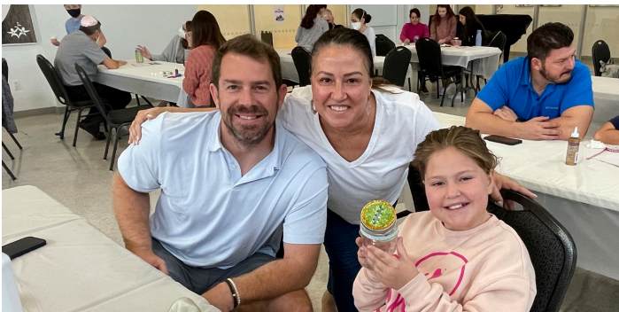
5 TH GRADE TZEDAKAH