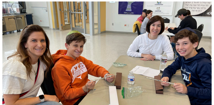
6 TH GRADE TORAH