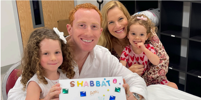
PRE-K MISHPACHA (FAMILY)

Each grade level's program had a specific focus or theme: