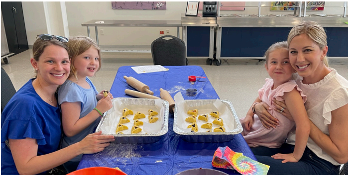
1 ST GRADE SIMCHA (CELEBRATION)