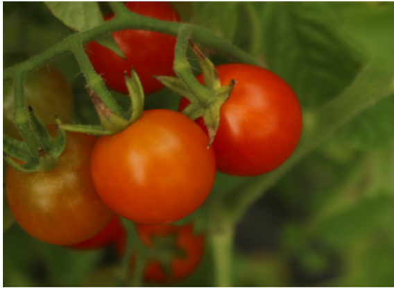
Jessie's Garden Cherry Tomatoes

The Social Action Committee will once again be holding the High Holiday Food Drive. We are grateful to be able to be back in the synagogue for High Holy Day services, and we ask that you remember the less fortunate members of our communities by contributing groceries which will be delivered to our local food pantries. There will be a shopping cart in the lobby where the groceries can be deposited. When you're out shopping, pick up an extra toothpaste, a jar of peanut