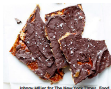
Food