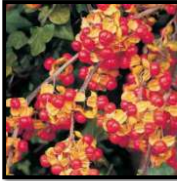
Celastrus scandens L. American Bittersweet