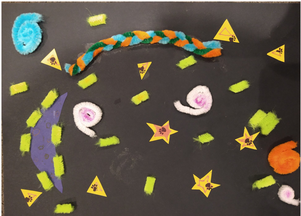
'Light' by Rosa Wolchover

All children take part in a weekly Kiddush ceremony in class.