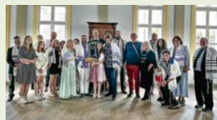
The Bnei Maskilim Community