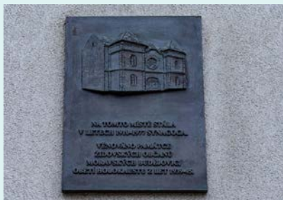
Plaque marking the site where the synagogue once stood in the town

Moravske Budejovice is a small town in what was once the southern part of Moravia, now the Czech Republic. The photograph below is of a plaque marking the site where the synagogue once stood in the town. Jews had lived here since the 14th century, but the community was expelled in 1564 and there were no Jews in the town again until 1774.