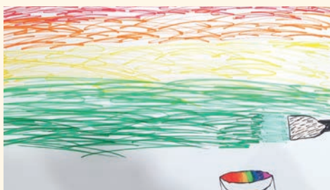
The heavens declare the glory of God, the sky proclaims God’s handiwork from Psalm 19