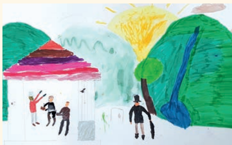
Happy are those who dwell in your house, who are ever singing your praise from Psalm 84

During this academic year Kittah Zayin (Year 7 students aged 11-12) learned about the structure of the Shabbat morning service, and about Birchot HaShachar and P’sukei d’Zimra , the earlier sections of the service. Alone or in small groups, the students chose a Psalm which inspired them, and picked a particular phrase which resonated or felt special. They then designed large images to represent what the words or phrases they chose meant to them. As you can see in the drawings displayed here, the images created were striking, and allowed the young people to bring the text to life in a colourful manner, enabling them to understand and express the beauty of the text in their own way.