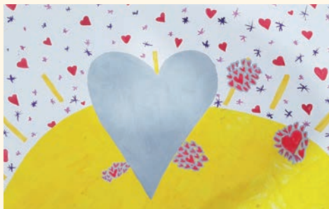
To tell of your love in the morning from Psalm 92