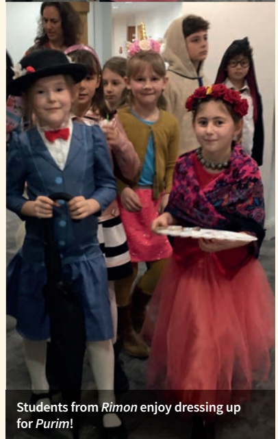
Students from Rimon enjoy dressing up for Purim!