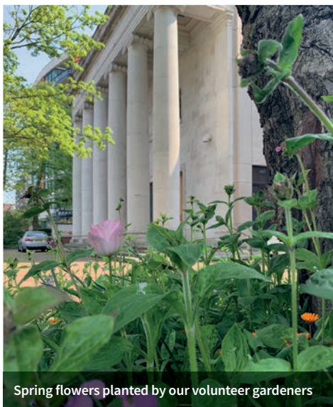
Spring flowers planted by our volunteer gardeners

This information about the stalls at the Freshers' Fair is correct at the time of going to press. Please note it is not a comprehensive list of all the volunteer work undertaken by the LJS. All volunteers should please be assured that their contribution, whatever area it is in, is recognised and appreciated.