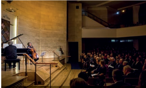
The Wiener Library concert at the LJS, November 2018