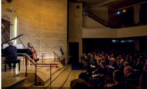
The Wiener Library concert at the LJS, November 2018