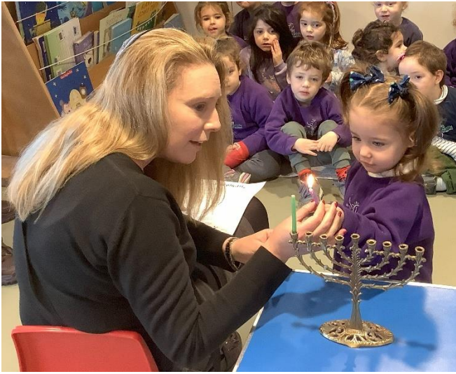
Lighting the candle for the 1 st night of Chanukah