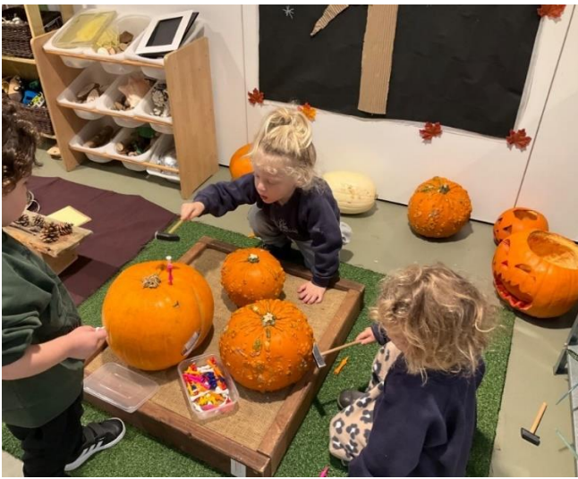
Recycling pumpkins for a fun fine motor activity