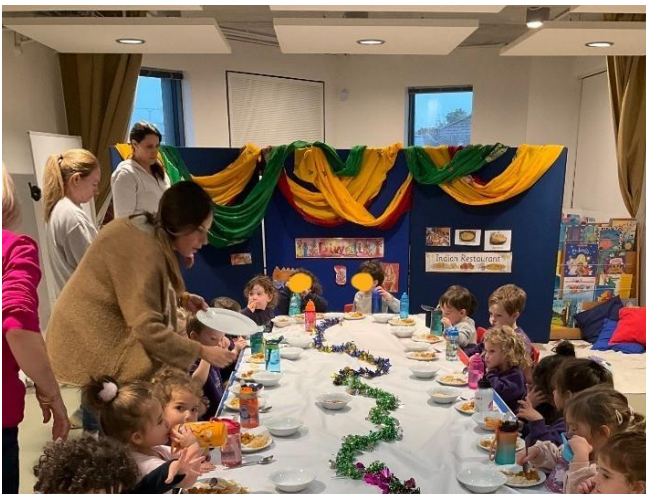
Enjoying our delicious Diwali feast