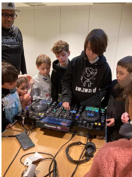
Learning DJ tricks at Sunday Funday

We have had so much fun at our Sunday Fundays this term, with lots of children exploring new activities or reacquainting themselves with something they've done before. One of our favourites was the DJ Sunday Funday, where the kids learnt to mix music on a real DJ deck! Our January Sunday Funday is already fully booked, so don't forget to sign up soon for the later ones, so that you don't miss out!