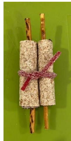
A sweet Torah – good enough to eat!

The weeks have flown by this term, as we have covered a combination of the High Holidays, Shabbat, Mitzvot and Chanukah at Kochavim. We delved into the stories behind the chaggim, the "why"s and the "how"s of Shabbat, and the miracle of the Chanukah story. We were also excited to participate in the mitzvah of hospitality on Mitzvah Day, opening our building to and sharing activities with some local asylum seekers. We are currently in discussion with our partners at 8 th Rung to see how we can take this forward, ensuring that we don't stop at one event for Mitzvah Day.