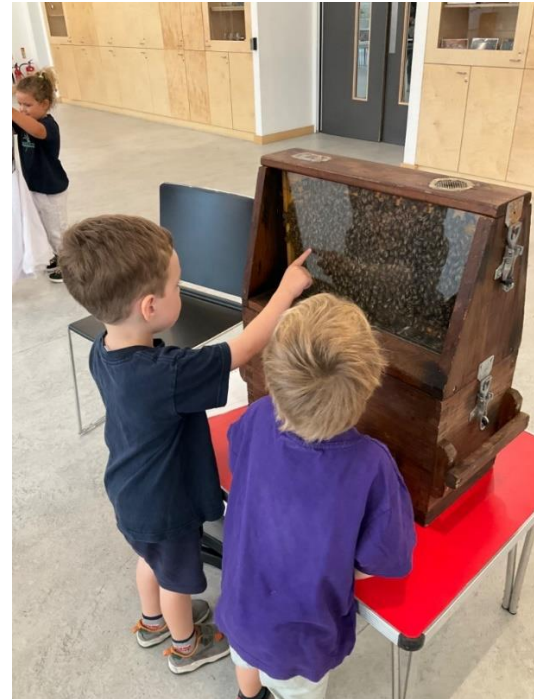
Looking for the queen bee in the beehive

Please note: FRS Members get priority places on waiting lists.