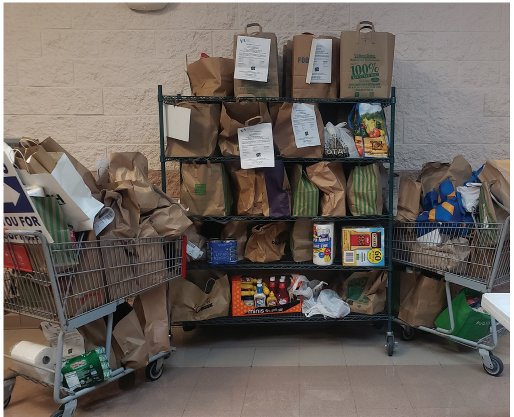
Grocery donations collected by Seaside's second annual High Holiday Food Collection Drive.

With these donations, along with other ongoing Community Service committee activities, such as the Soup Kitchen and Food Rescue, Seaside members are continuing to make a positive impact on Sussex County by helping those in need. Thanks again to all who contributed for your amazing generosity!