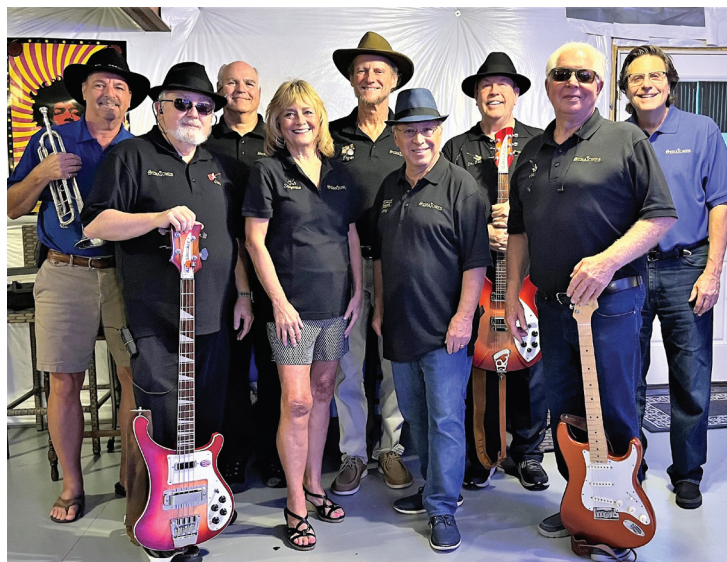
Our local band the Senatones are preparing for the event.

Don't miss this special Seaside social event! Registration is required through the link on Seaside's web site or our weekly e-blasts.