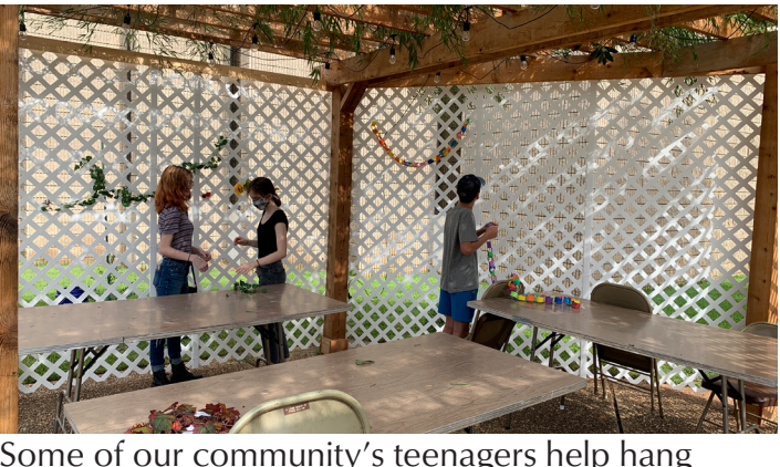
Some of our community's teenagers help hang decorations inside the Sukkah on September 19.