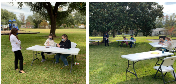
6th grade meetup