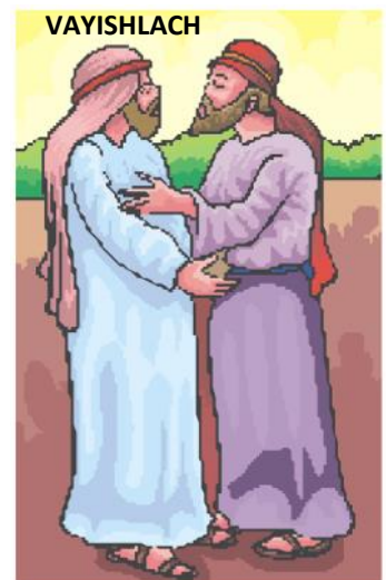
Yaakov meets Esav