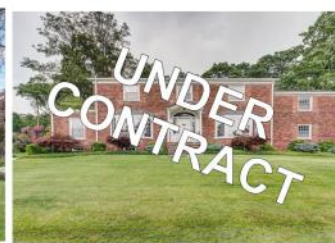
65 Glenview SO