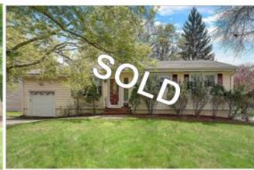
3 Dockery Dr WO