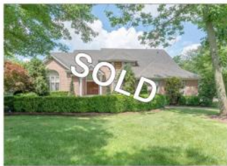
28 Chelsea in Bel Air, Livingston

FABULOUS! 50 Mullarkey Drive in the Woodlands. Fantastic Aspen with upgraded kitchen, bathrooms and HVAC system! Only $489,000.