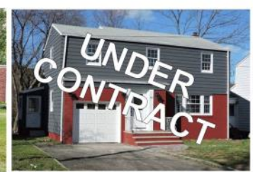
41 Buckingham WO

A fabulous new listing in the Woodlands coming soon! Lowest price for the largest model. Stay tuned!