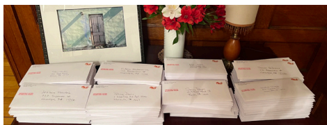
300 of the 1500 letters written by CDT members and friends!

CDT is working with the non-partisan organization The Civics Center in a letter writing campaign aimed at encouraging teens to register and vote. To kick off the project, four events were held in which members gathered in homes to write letters. At these events, people learned more about the letter writing campaign and enjoyed one another's company while working. Using materials provided by The Civics Center, they wrote a brief pre-specified message and stuffed and addressed envelopes to be sent to Pennsylvania mothers. The mailings contained all the information the recipient would need to help their teen to register. In total, we wrote 1500 letters in 8 days!