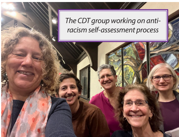
The CDT group working on anti-racism self-assessment process