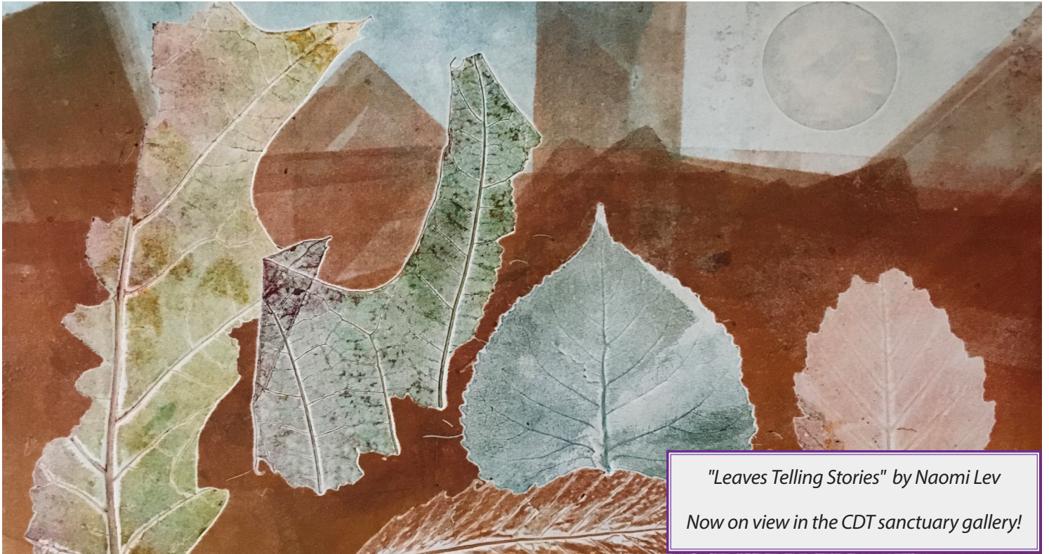
"Leaves Telling Stories" by Naomi Lev

Now on view in the CDT sanctuary gallery!