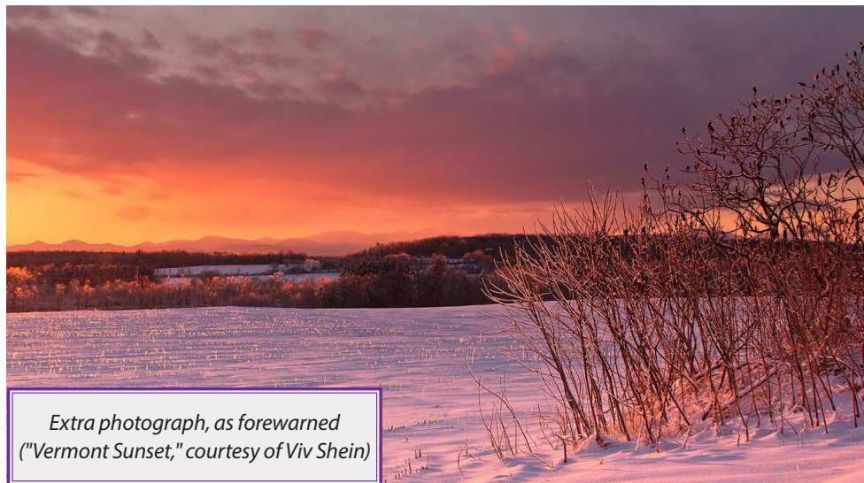
Extra photograph, as forewarned ("Vermont Sunset,")

With that, I will say I look forward to meeting everyone, and am here to help in any way I can.