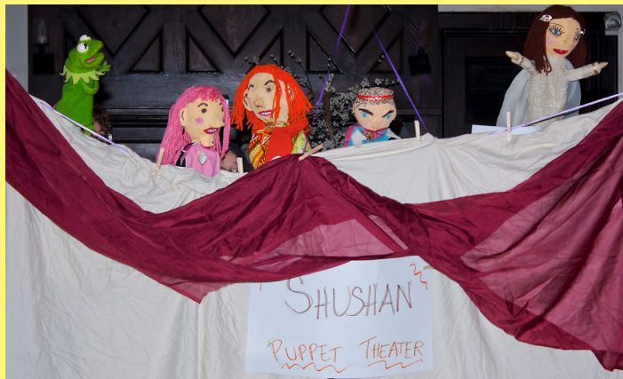
Purim Spiel & Puppet Theater 5773 (March 2013)