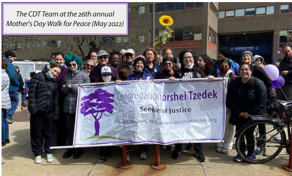
The CDT Team at the 26th annual Mother's Day Walk for Peace (May 2022)

All members of CDT are welcome to attend this final session of our winter 2023 study group. Reading in preparation for each session is encouraged but not required. More details, Zoom registration, and links to readings can be found on the CDT calendar and at www.dorsheitzedek.org/israel-palestine-peace .