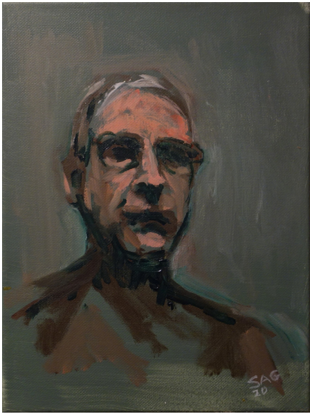
Self-portrait. Acrylic on canvas.