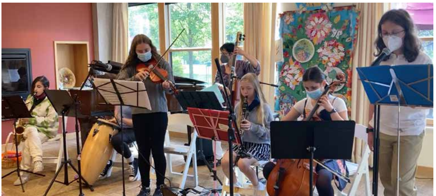
Photo: "Rubber band" performing a selection of songs and sharing an hour of music with the residents at Newbridge on the Charles.

Please feel free to reach out to any of the CDT Board members (listed on page 2) to give them feedback, volunteer your expertise, or ask questions about what's going on!