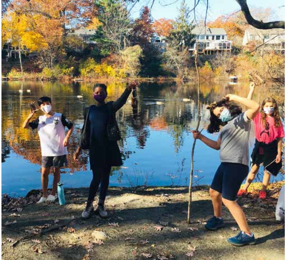
Kitah Hey students at an in-person CDT Religious School day, showing the woven rafts they built in their exploration of the basket that Moses' mother wove for him.