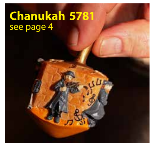
Chanukah 5781 see page 4

This twice-weekly session of guided and silent meditation is open to all, regardless of level of meditation experience. Led by experienced CDT members and Rabbi Toba, Mindful Mornings is an opportunity to cultivate qualities of patience, equanimity, compassion, and resilience. Drop-ins are welcome! For those in mourning or observing a yahrzeit, Kaddish is recited at the end of each meditation session, at approximately 9am. Zoom info is available on the CDT website (for non-members, please email office@dorsheitzedek.org for the Zoom info). The sessions on December 24 and 31 will be unguided - meaning all are welcome to just show up and share the silence.