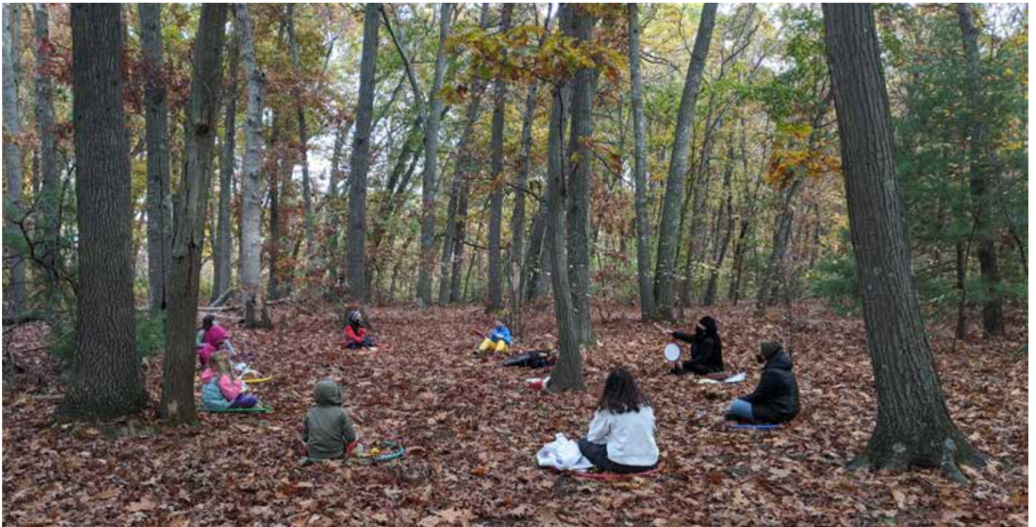
Kitah Bet meeting in person for the first time this year, safely in the woods at Auburndale Cove. Each second grader sat within a hula hoop to be sure everyone was socially distant!