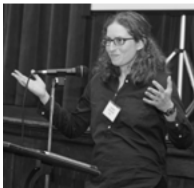
CDT members speaking at last May’s membership meeting.