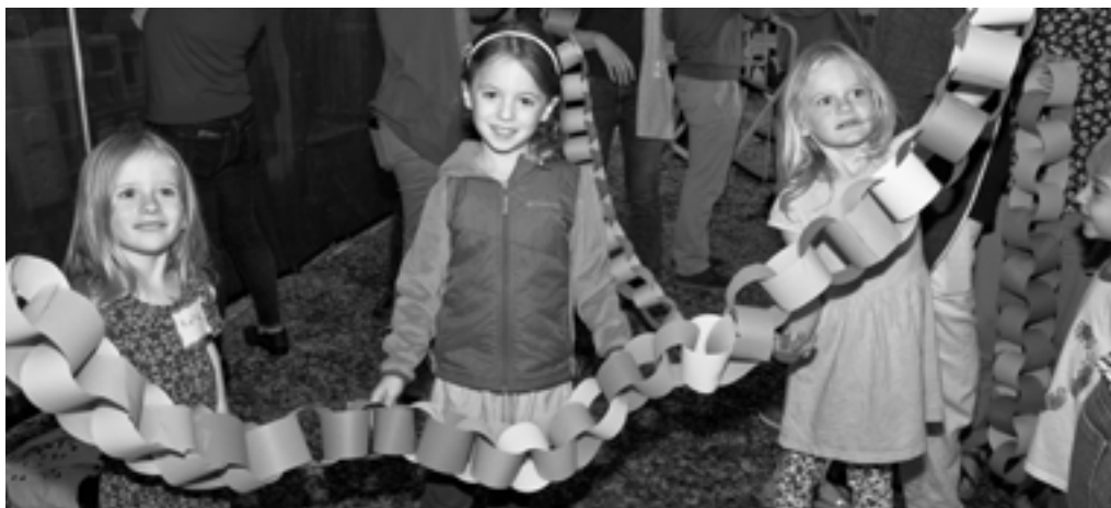
CDT celebrates Sukkot 2019.

We will have a few parent brunches hosted on Nitzanim/Gan Sunday mornings at JCDS for families with younger children (ages 0-3) to come and meet the Nitzanim families, hang out together (with their younger kiddos), and get to know the program and the space. Save the dates for Sunday morning Feb. 9th.