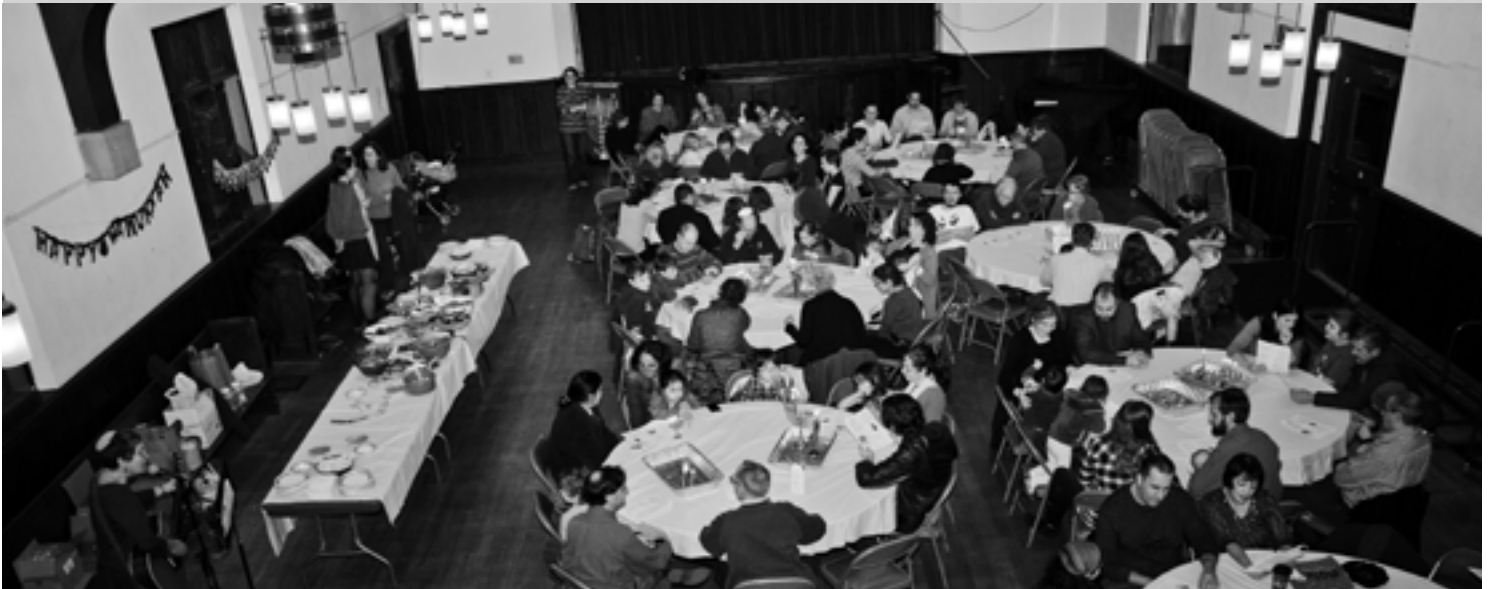
CDT members celebrate Hanukkah in 2016.