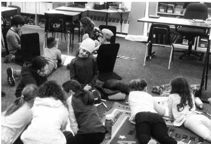
Photo: Kitah Dalet kids hard at work.

It is easy to look around us and feel despair at all the brokenness in our world. But to keep living, hope is essential. Where does this hope come from, and what is it really?