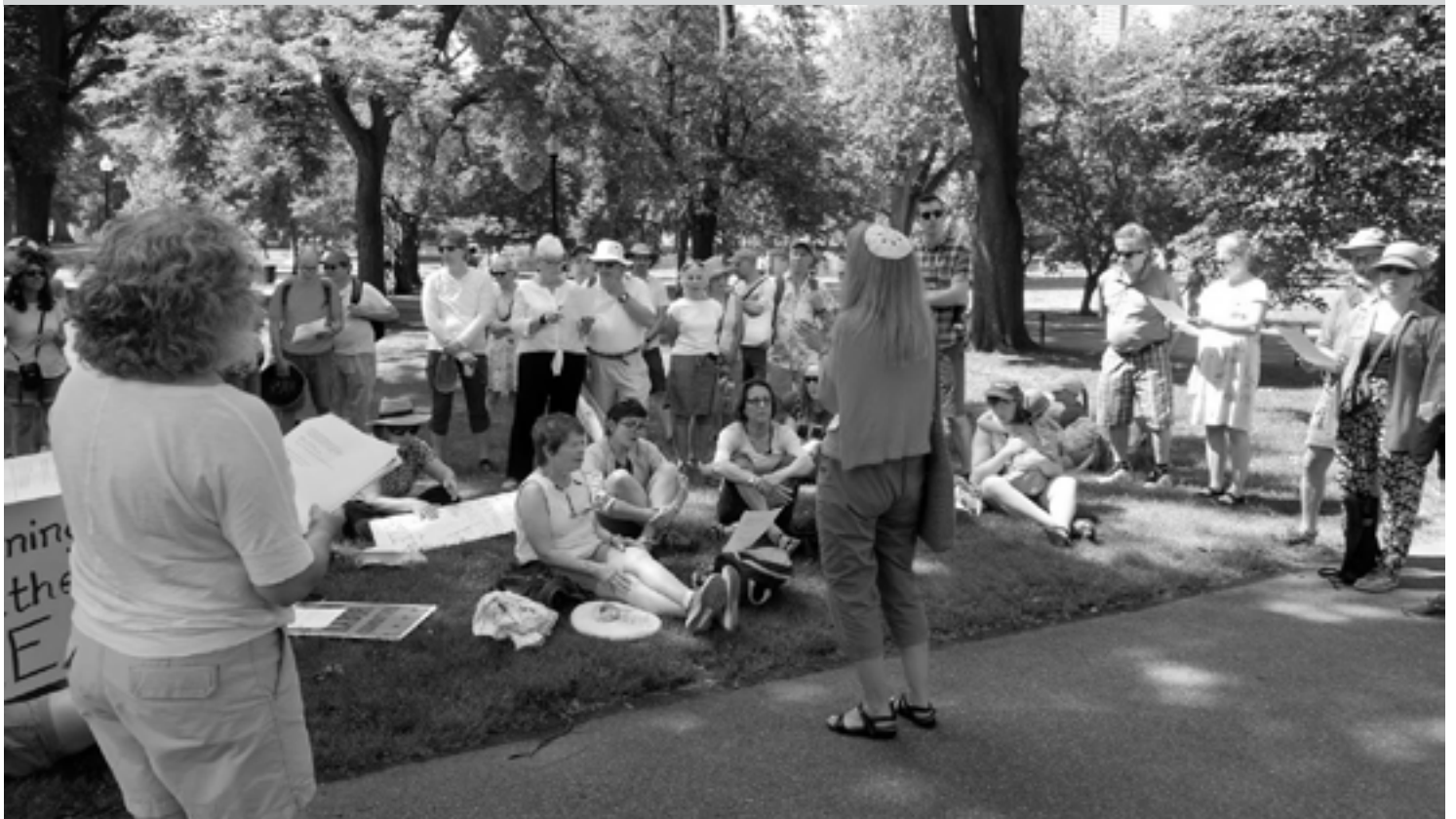
CDT members hold a service in Boston Garden before a June 30th march to protest the Trump Administration immigration policy.