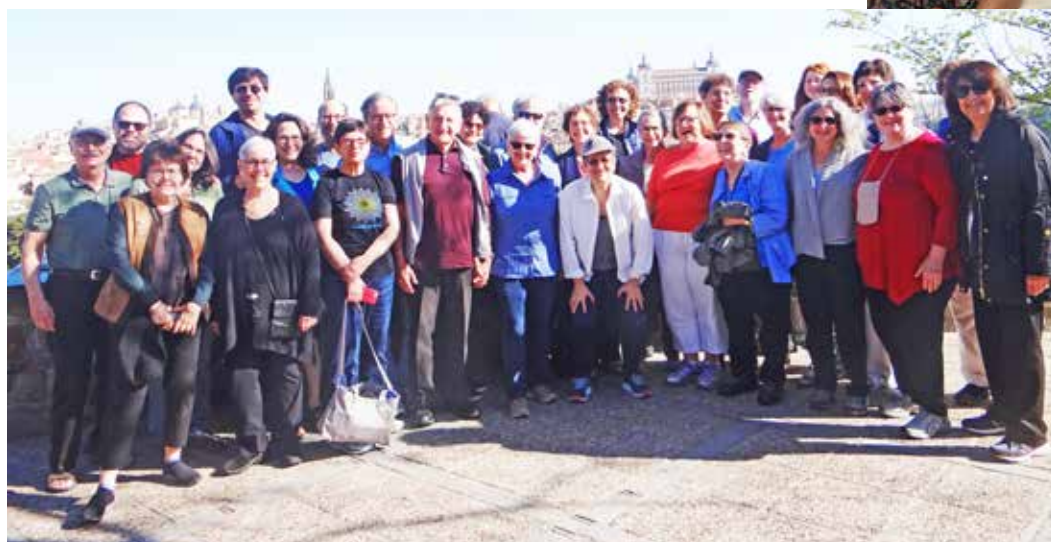
CDT Members Enjoying Toledo, Spain