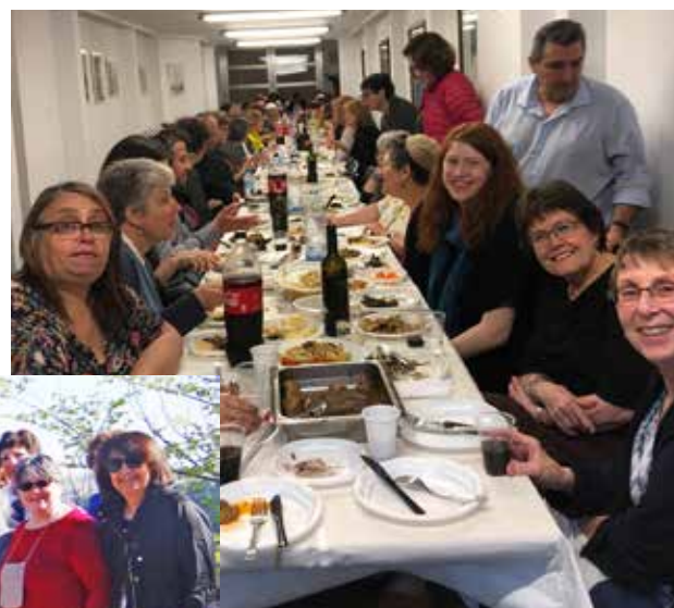
CDT Spain-trippers share a wonderful Shabbat meal provided by Temple Bet Shalom in Barcelona