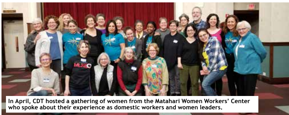
In April, CDT hosted a gathering of women from the Matahari Women Workers' Center who spoke about their experience as domestic workers and women leaders.

If you are interested, feel free to visit www.domesticemployers.org , or download information at http://www.mass.gov/ago/docs/workplace/domestic-workers/dw-notice-of-rights.pdf