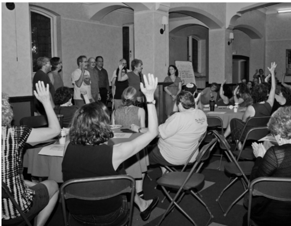
Photo: CDT members at the members meeting, June 2017.

If you have comments, ideas, or concerns about CDT, please be in touch. My e-mail is: medvedow@gmail.com (that's the best way to reach me). If we haven't met, please be sure to introduce yourself to me next time we're together. I really do hope to have a chance to get to know everyone.