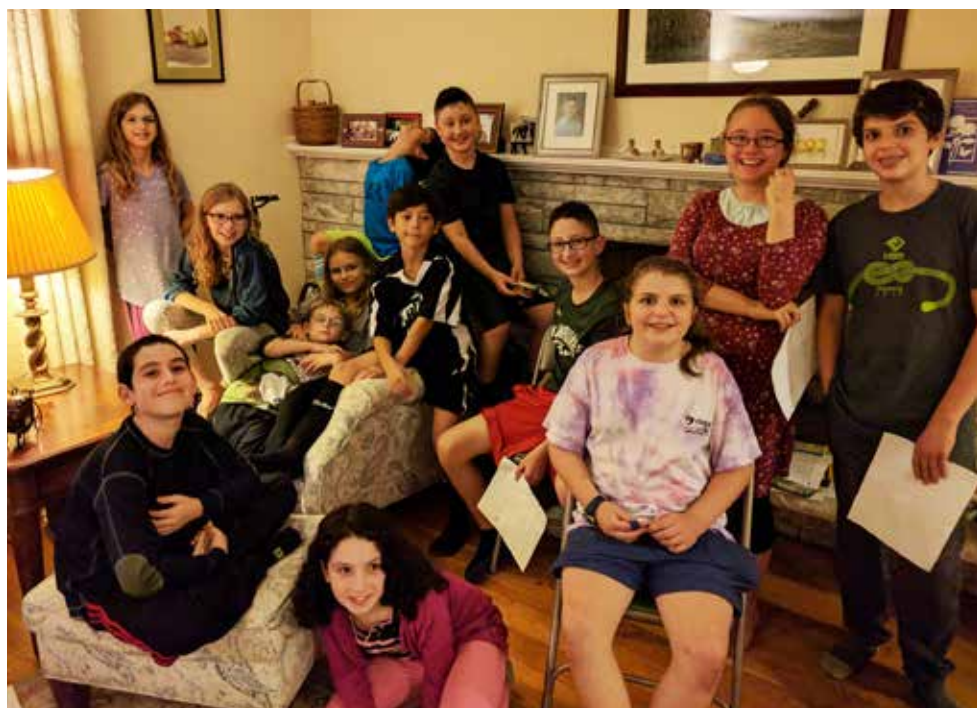
Many of the families of Kitah Hey gathered to bring in the week with pizza, babka, and havdallah.

Happy to be returning for my third year on the CDT Religious school staff. My passion for Jewish life and learning has motivated me to move my teaching career from the public school sector as a Spanish teacher to working in an early childhood center. I grew up outside of Philadelphia, graduated from McDaniel College in Maryland, and moved to Boston to pursue and receive my Masters in Education (MAT) at Simmons College. My strong Jewish identity was formed in the small Reconstructionist congregation in which I grew up, then cemented during the five years I spent working at Camp JRF. I love the Boston area and the community here. I also love chocolate, I am a coffee snob, enjoy watching movies and theater, and will spend time curled up in front of any Jodi Piccoult book! Looking forward to another great year in Kitah Bet.